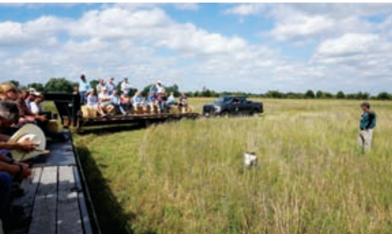
MDC's Stony Point Prairie Conservation Area.

A similar process is being used in the nearby Stony Point Prairie Conservation Area which is working closely with the neighboring private landowners to create a patchwork of managed native grass properties. MDC has learned that the grazing component of management is essential – they documented a 12-fold increase in