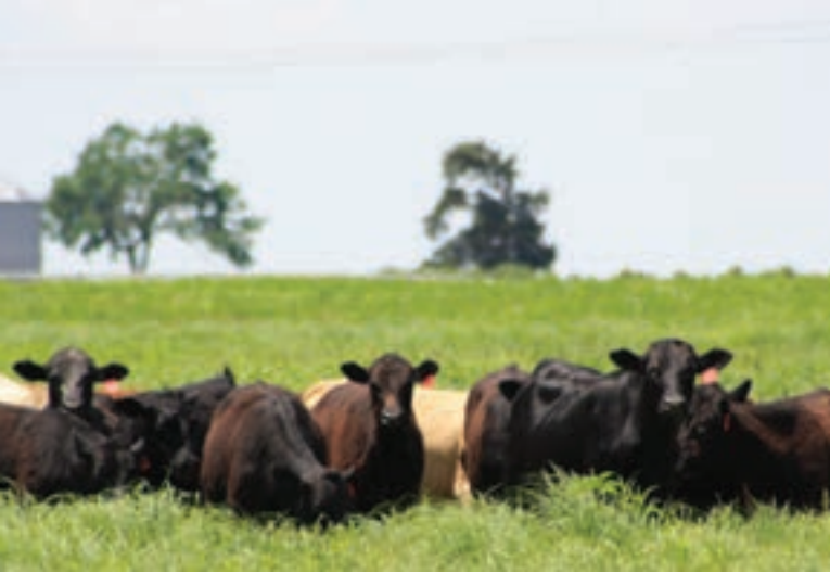
Cattle on Dave Haubein's farm.

grasshopper sparrows where grazing and fire are used together as opposed to fire alone. The grazed units in the area have better nest success and higher adult survival in northern bobwhite because grazing opens up the grass allowing the quail to move around better and yet still have plenty of cover – the tracked birds showed that they spend 90 percent of their time in the grazed or burned units, or both.