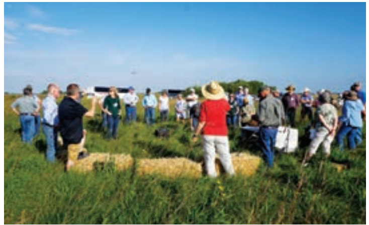
Learning about the Poirot Farm's agricultural operations.