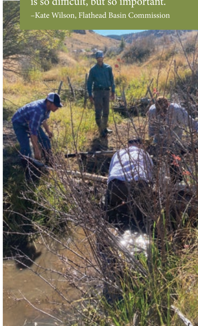
Members of the Idaho Rangeland Conservation Partnership steering committee worked with ranchers and the Idaho Department of Fish and Game to build beaver dam analogs that will help with stream restoration on the Josephine Ranch.