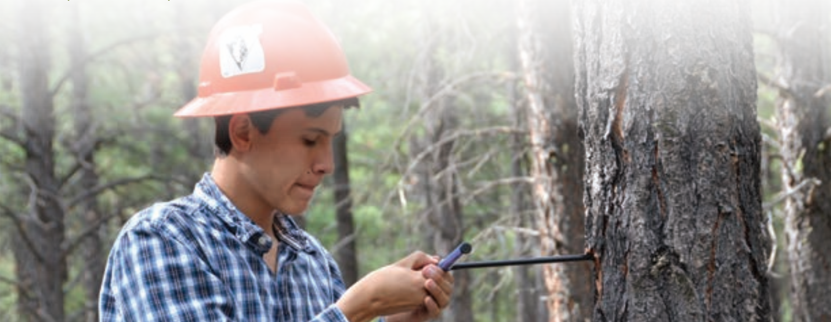
Forest Stewards Guild youth crew in the Zuni Mountains Collaborative landscape collecting forest data that was used as part of an 80,000 acre NEPA analysis to enable forest restoration.

—Eytan Krasilovsky, Zuni Mountains Collaborative, Greater Santa Fe Fireshed Coalition